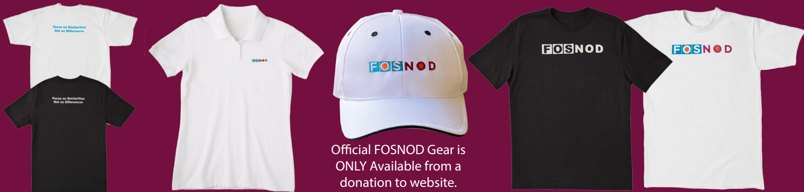
Official FOSNOD Gear is ONLY Available from a donation to website.

FOSNOD will cover all shipping costs globally. The goal is to spread the movement!